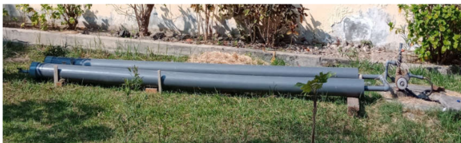
Fig. 2. Tripikon Infiltration Model